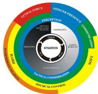
National Use of Force Framework